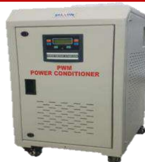
IGBT Static Stabilizer 5 KVA - 500 KVA