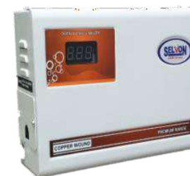
Digital AVR 0.5 KVA - 10 KVA