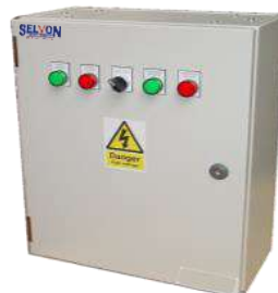
AMF Panel 10 KVA - 500 KVA