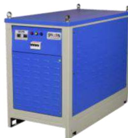
Isolation Transformer 1 KVA - 1200 KVA