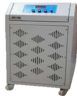
On-Line UPS 1 KVA - 500 KVA