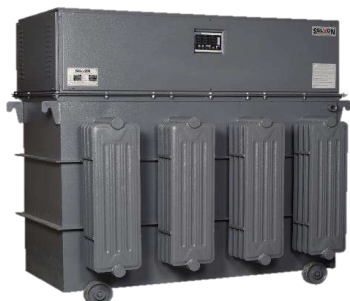
Oil Cooled Servo Stabilizer 1 KVA - 5000 KVA