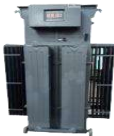
Linear (Roller) Servo Stabilizer 10 KVA - 5000 KVA