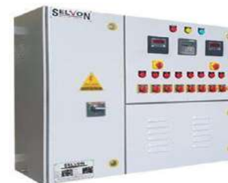
APFC Panel 1 KVR - 500 KVR