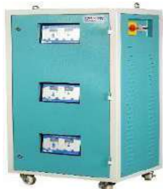
Air Cooled Servo Stabilizer 1 KVA - 100 KVA