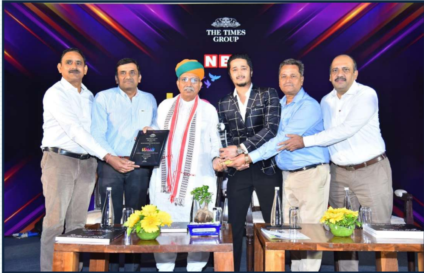
Selvon Instruments Pvt. Ltd. Being Felicited By Minister Of State For Parliamentary Affairs And Culture Arjun Ram Meghwal For Outstanding Performance In The Field Of Stabilizer And Power Line Equipments